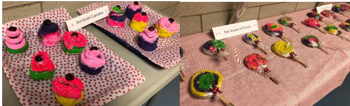
In 2nd and 3rd grade art class, students made cupcakes and lollipops out of clay.

Spring clubs ended this week. Thank you to all who took the time to lead each club. Let us know if you want to lead a club next year!